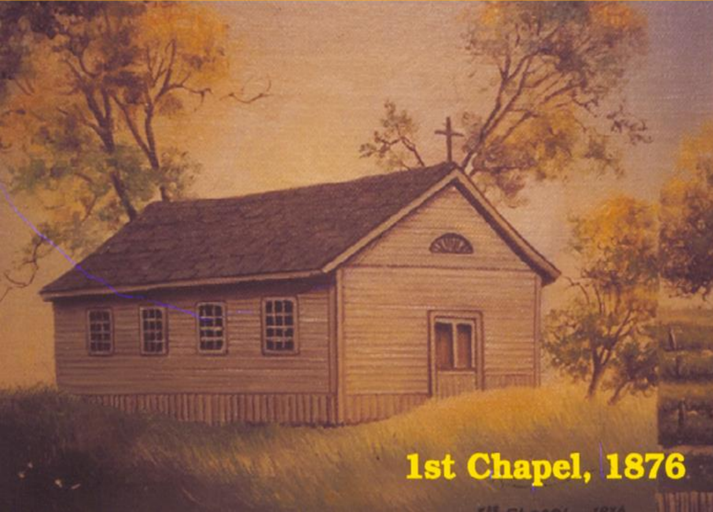
1st Chapel, 1876